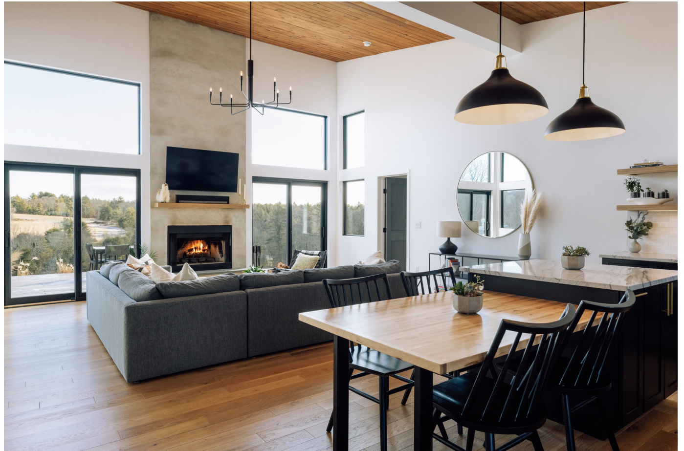
The great room has a wall of windows and sliders with a magnificent view. The open-concept living/dining/kitchen is comfortable and not overly big.

A detached, two-car garage measures 440 square feet for storage and weather protection. Although the home is on a huge plot of land, it's still just a 13-minute drive to Narrowsburg and a delicious coffee at Tusten Cup, or 15 minutes to arts and culture at Bethel Woods Center for the Arts. Built in 2020, the house has settled into its environs, and the lucky new owner will find a turnkey paradise.