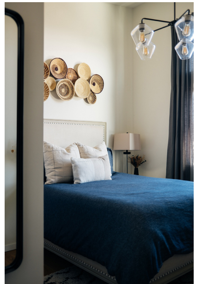
This secondary bedroom is cozy and boasts a modern chandelier.

The back bedroom is currently used as an entertainment/TV room. It's painted a moody blue/black that's highlighted by a wide clerestory window and the same slider/clerestory combo as elsewhere in the house. Like the other bedrooms, this has a modern chandelier for after-dark illumination. The sliders open to a bluestone patio and, of course, that view. — Page 17