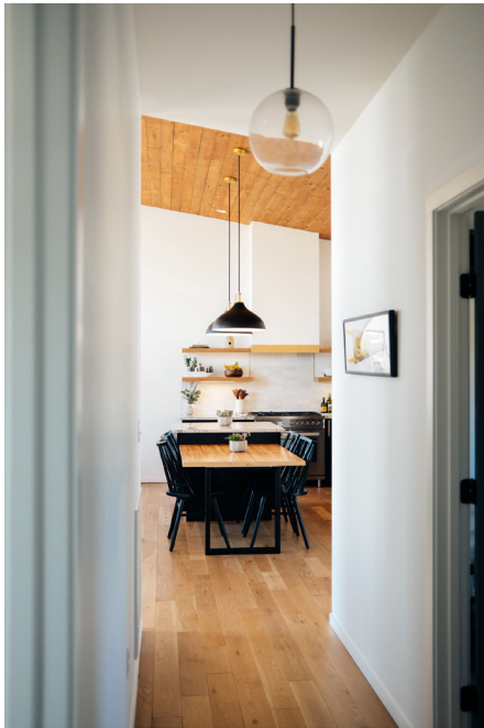
With pine ceiling accents and white walls, the house was designed with a beautiful minimalism.

Charming Cottage In The Catskills! There Is Plenty Of Room With An Inviting Living Room, Eat-In Kitchen, Three Bedrooms And One Bath. The Spacious Loft Boasts A Gorgeous Panoramic View Of The Countryside, Many Upgrades Were Made Throughout, The Wood Stove In The Living Room Adds To A Toasty Ambience On Chilly Nights. Additional Living Space Can Be Found On The Decks Where You Can Sit And Relax. Or Escape To The Hot Tub And Then, Gather Around Either Fire Pit And Enjoy Good Conversation With Friends Or Bask In The Sound Of The Babbling Brook. Asking $475,000 MLS# 6182864