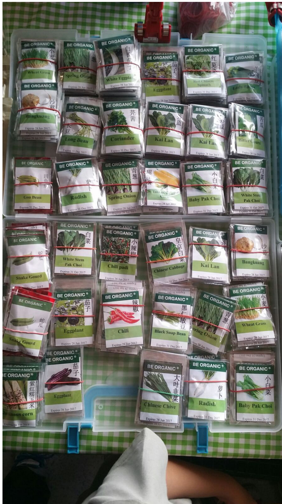
It's fun to shop for seeds when planning your garden.

The last thing you'll definitely need when indoor sowing is patience. Waiting for