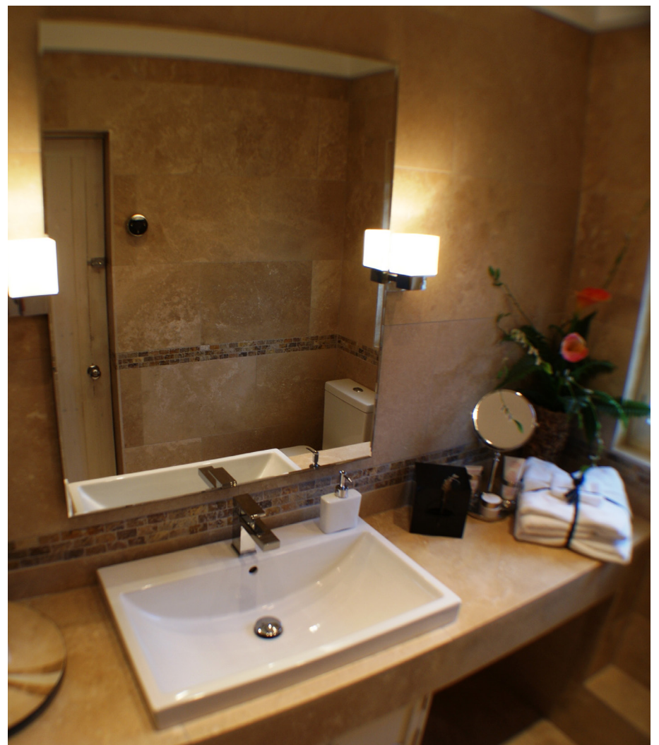
Sconces and mirrors are functional and beautiful.

So, there you have it! Improving your home doesn't have to be daunting. You can start feeling better about your space right away, without breaking the bank with these simple and DIY-friendly changes.