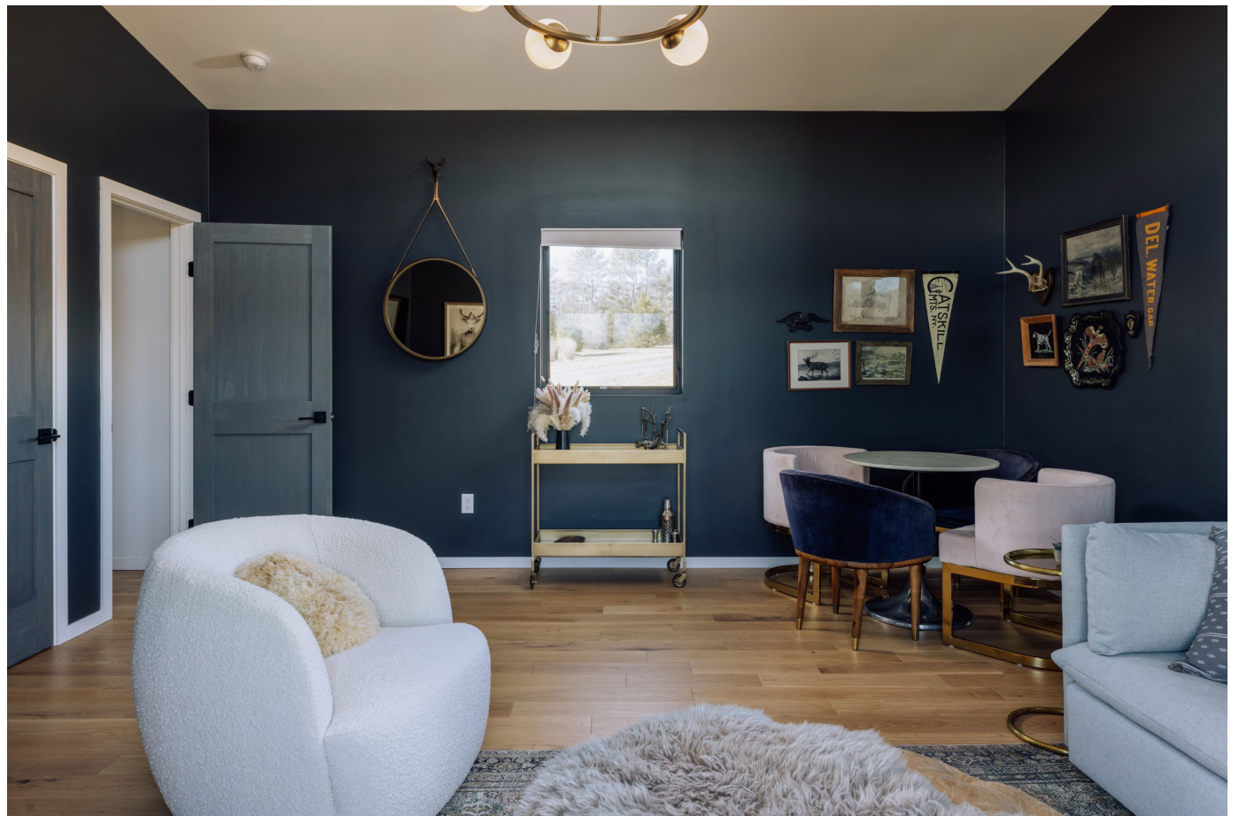
The fourth bedroom is currently used as an entertainment/TV room. It's got moody, blue-black walls and room for a sofa, chairs and tables.