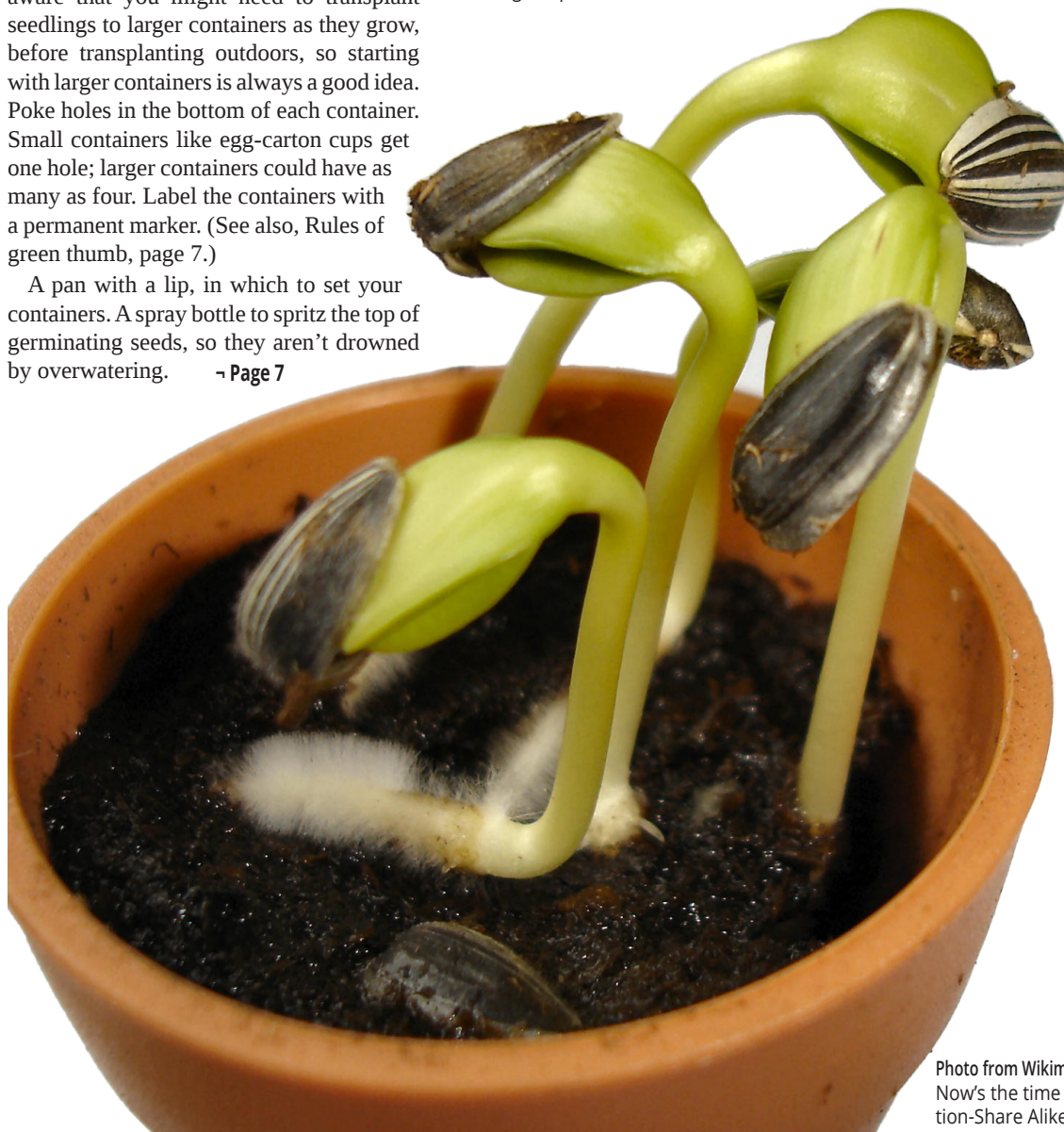
Seedlings require a little care indoors.