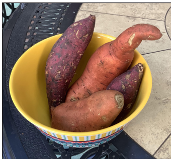
Sweet potatoes in Oaxaca, Mexico.

Oaxaca has plenty of farmers' markets, both outdoors on certain days of the week and indoors daily. The variety of fruits and vegetables—some known and others to be discovered—is staggering, and I like nothing better than to walk among the booths searching for the perfect avocado or mango. Quite a few vendors recognize me now and point me to, or hand me, what they know I have come to purchase often and in what state I want it. I know their